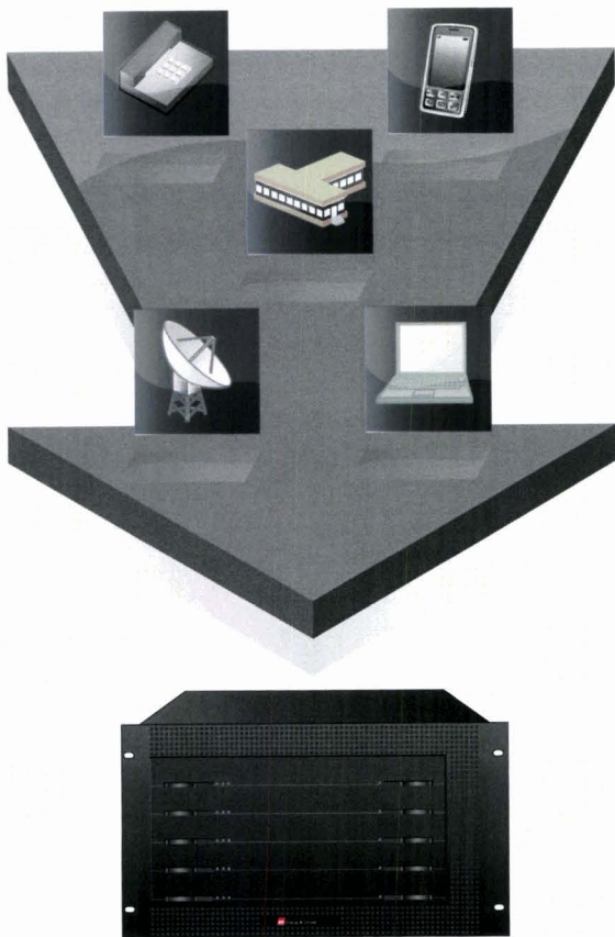
Demon & Demon X-Stream