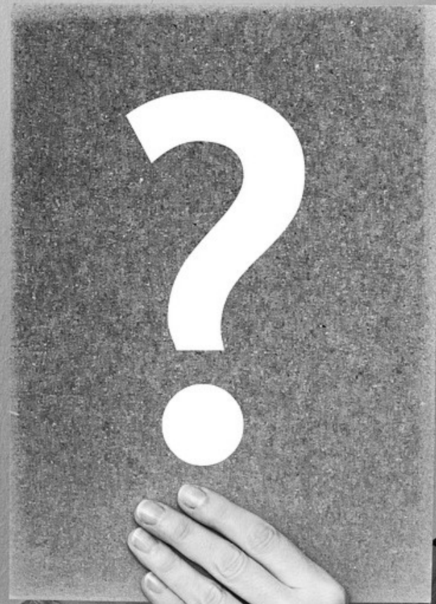
Image credit: https://pixabay.com/en/question-question-mark-survey-2736480/