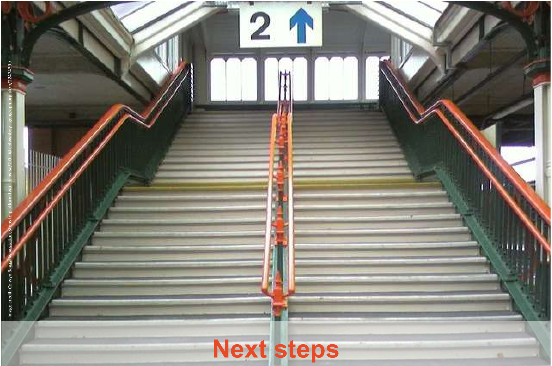
Colwyn Bay railway station, steps to platform two.